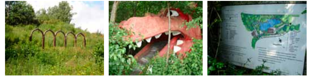
6, 7 & 8. Liverpool Garden Festival site, Dingle, July 2008

This, of course, fails to consider the extent to which the space has generated and played host to a diverse array of socio-cultural practices that fall outside this overarching logic of capital accumulation and rational productivity. These other forms of engagement (in particular those prompted by the site's rich ecological and wildlife resources) can be observed and, indeed, experienced by visiting the location, access to which, without prior consent from the owners, is considered to be trespass and hence illegal. Security staff keep a half-hearted vigil near the