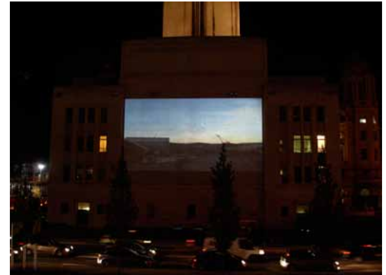
2 Projection of the film Terminus (Ben Parry, 2008) on east wall of George’s Dock Building, Pier Head, Liverpool, October 2008

the defining topographic features. Filmed at the height of elevation of the former railway and projected onto the side of George’s Dock Building at Pier Head (see Figure 2), Terminus ’s cinematic geographies conjure a spectral urban vision that throws into stark relief the spatially dissonant and disembedded landscapes that mark – and memorialize – the site as a space of absence. 16